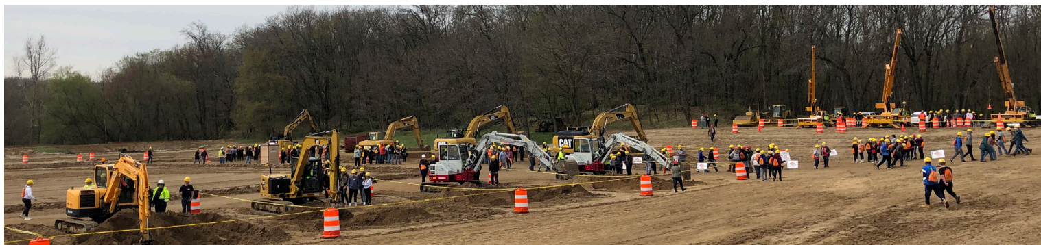
Students operate construction equipment at the Michigan Construction Career Days event in May 2022.

The Workforce Development and Participation Strategy supports training and pre-apprenticeship/apprenticeship opportunities for local youth, which includes promoting skilled trades and educating students about pathways into careers in construction. To support this goal, the project team has participated in multiple presentations and events over the past months.