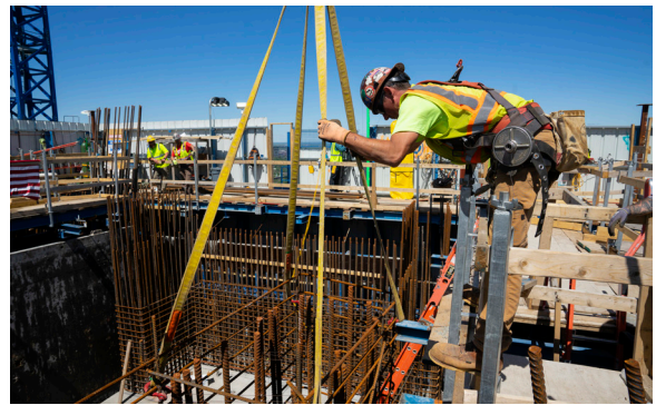
Ironworkers construct the bridge tower in the US.

local* businesses engaged on the project