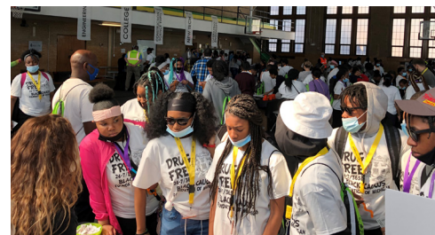
High school students engage with project representatives at the Michigan Construction Science Expo.

This May event at the Durfee Innovation Society provided an opportunity for middle and high school students interested in engineering and construction careers to engage with skilled trades and construction design industry experts.