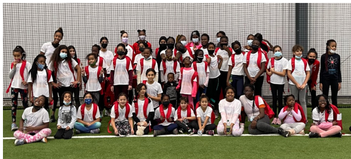
Over 70 girls enjoyed the Girls Can Summit Series in December.

Border City Athletics Club received $10,000 to support the Girls Can Summit Series in December 2021. The event provided an opportunity for over 70 BIPOC (Black, Indigenous, People of Colour) girls to be physically active and meet Olympians and elite athletes from different sports.