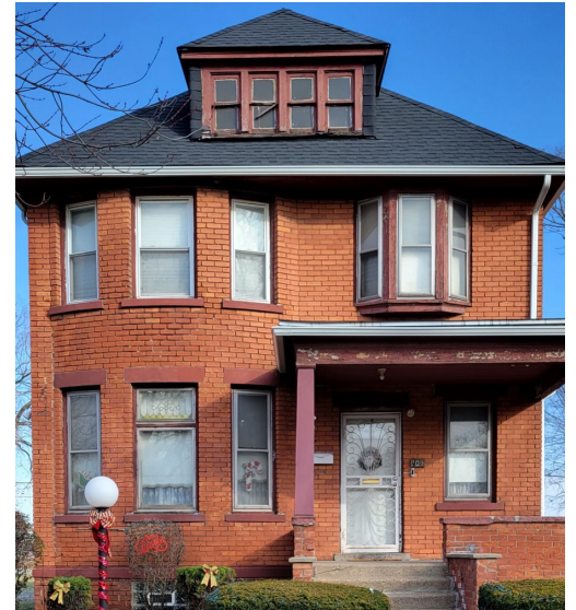
The first completed roof replacement of the Delray Home Improvement Program.

For more information on the program and how to apply, visit GordieHoweInternationalBridge.com .