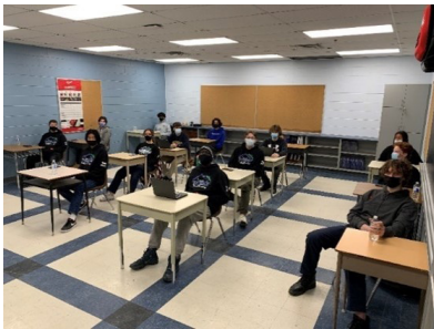
These students from a Construction Academy Plumbing Class were part of 33 classes that took part in a virtual project presentation.

The Gordie Howe International Bridge team presented to more than 700 high school students from the Windsor Essex Catholic District School Board Construction Academy in December 2021. Students heard first-hand what it's like working on a once-in-a-generation project from a site superintendent, crane operator, electrician, and mason. Over 33 classes participated in the presentation.