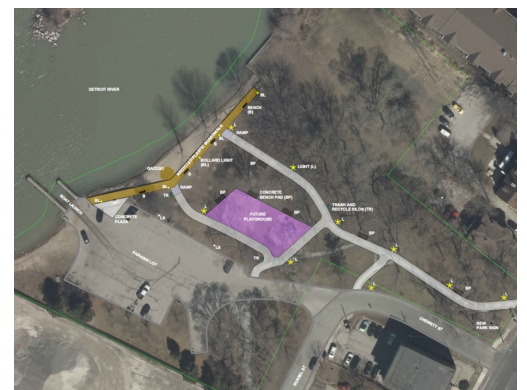
McKee Park improvements are expected to begin in spring 2022.

In January 2022, the City of Windsor received $200,000 as part of the Community Benefits Plan initiative to invest in Sandwich-area parks. The investment will support the construction of a new gazebo and improvements to the existing board walkway in McKee Park. These improvements will be carried out by the City. Construction is expected to begin this spring.