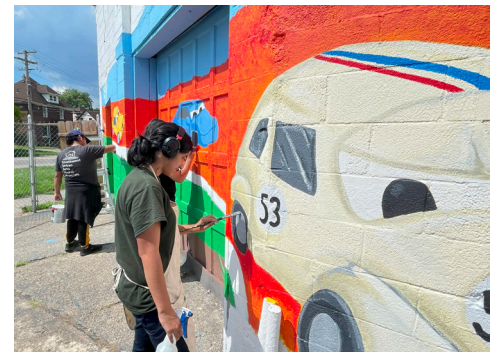
SUAMP artists paint a mural in Southwest Detroit.

Thirteen youth artists and five lead artists, ages 14 to 22, were employed by SUAMP in 2023. The youth learned color theory and mural design and applied these learnings over the summer months by painting murals in the Springwells community. This included collaborating on a large-scale mural on Lafayette and Wheelock in Southwest Detroit. SUAMP programming will continue to be supported by the Community Benefits Plan with additional community art projects delivered in 2024.