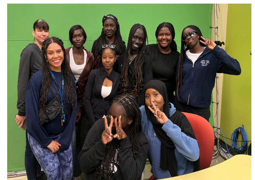
STAG Girls' Group participants enjoy an outing together.

In 2023, 28 young women from west Windsor aged 14 to 18, participated in STAG's Girls Group programming, including outings, educational trips, guest speakers and other activities that exposed the young women to a variety of sports and career paths, encouraging program participants to try new things. Through the program the girls set goals while enhancing their leadership potential and supporting their personal growth.