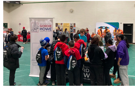
Students engage with project staff at the Skills Ontario Trades & Tech Career Day in February 2024.