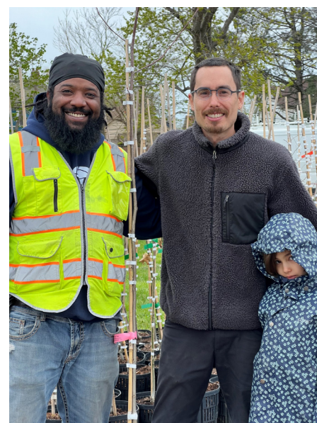
Southwest Detroit residents receive a free tree at the April 2024 event.