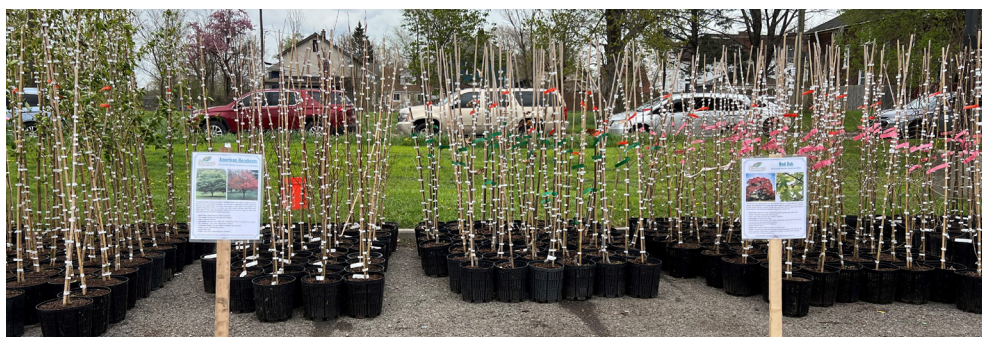
Residents could choose a tree from seven different tree species to take home.

Following an earlier event in 2021, this initiative has provided a total of 750 trees in Detroit. Additional environmental stewardship programming will be delivered by the Greening of Detroit in the neighbourhood in 2024 and 2025.