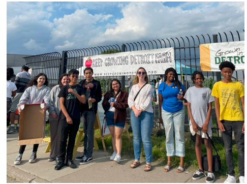
Congress of Communities youth group visits Keep Growing Detroit farm.

CoC has supported programming that connects young people to their roots as stewards of the land through a mix of gardening, intergenerational work, youth mentorship, environmental education and leadership development. The Youth Environmental Healing Program (YEH) launched in October 2023 and continues to engage youth ages 13 to 22 through bi-monthly meetings and stewardship activities.