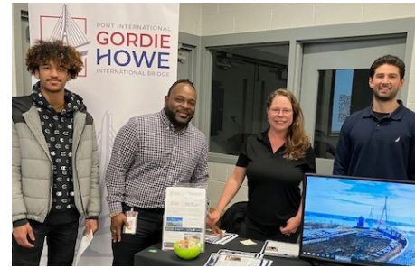
Project staff and partners attend a Career Day at Randolph Career and Technical Center in March 2024.