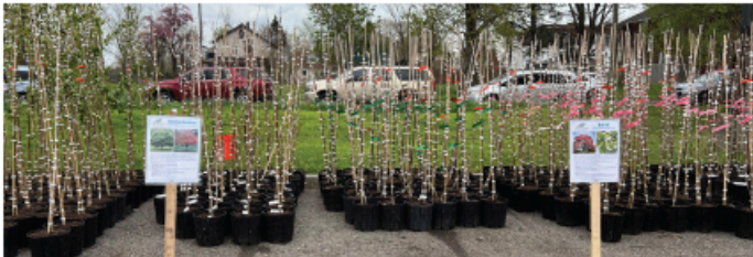
Residents could choose a tree from seven different tree species to take home.

Following an earlier event in 2021, this initiative has provided a total of 750 trees in Detroit. Additional environmental stewardship programming will be delivered by the Greening of Detroit in the neighbourhood in 2024 and 2025.