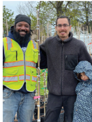
Southwest Detroit residents receive a free tree at the April 2024 event.