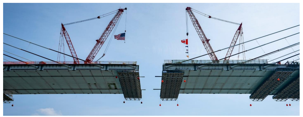
US (left) and Canadian (right) bridge decks close to connecting.