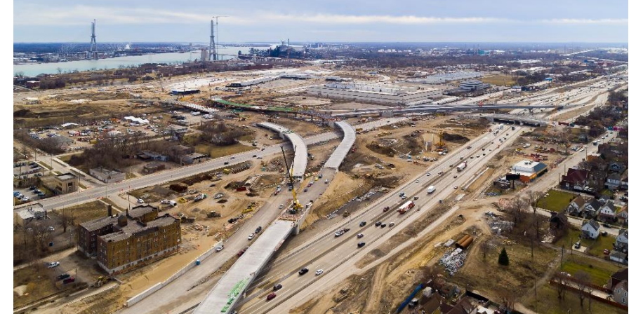
Michigan Interchange construction progress

Work on the 1.8 mile/3 kilometre stretch of I-75 is steadily progressing. The project team completed and reopened all four road bridges located over I-75 at Springwells Street, Green Street, Livernois Avenue and Clark Street and recently completed local road improvements to Campbell Street south of Fort Street. Crews continue on all five pedestrian bridges, with each at various stages of construction.