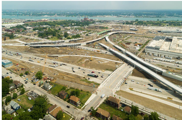
Solvay Street pedestrian bridge construction (left) and I-75 to US POE ramps (right).

Noise walls (traffic sound barriers) are being constructed along three sections of southbound I-75 to help mitigate highway noise for nearby residents. Noise wall locations include: