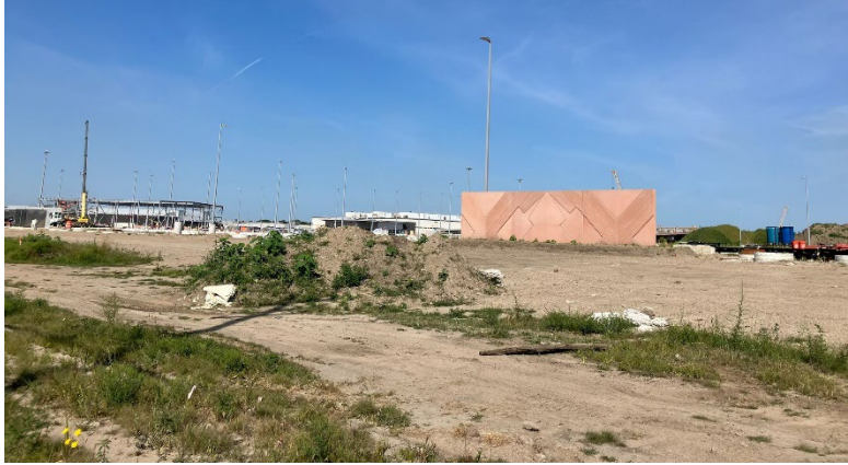
Jefferson Avenue barrier wall construction.

Construction of the Jefferson Avenue barrier wall, an eight-foot security wall along the US Port of Entry (POE), is underway. The barrier wall will face Jefferson Avenue spanning from Green Street to Campbell Street. Construction activities include installation of drill shafts, posts and precast panels. The wall features an aesthetic treatment that pays tribute to Historic Fort Wayne's unique star fort structure.