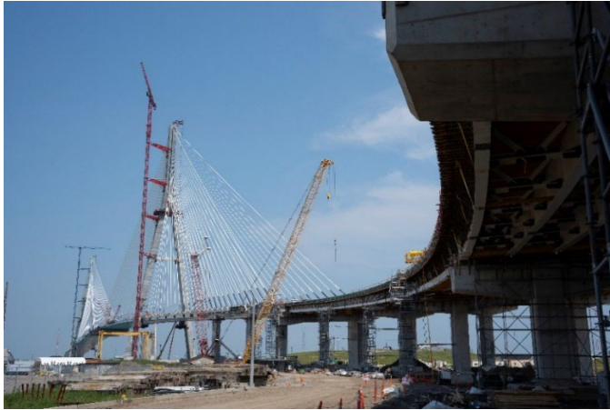
The Gordie Howe International Bridge under construction.

The Gordie Howe International Bridge team is steadily advancing all four project components, inching closer to opening day, anticipated to occur in fall 2025.