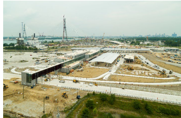
US Port of Entry (left) and the Canadian Port of Entry (right).