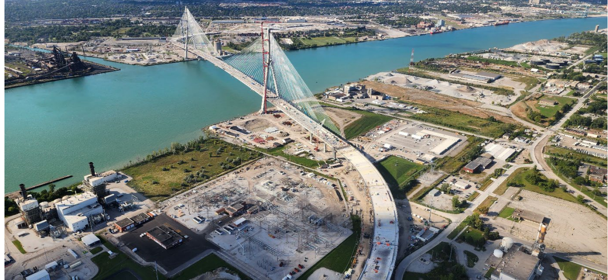
The Gordie Howe International Bridge under construction.

The Gordie Howe International Bridge team is steadily advancing all four project components, inching closer to opening day, anticipated to occur in fall 2025.