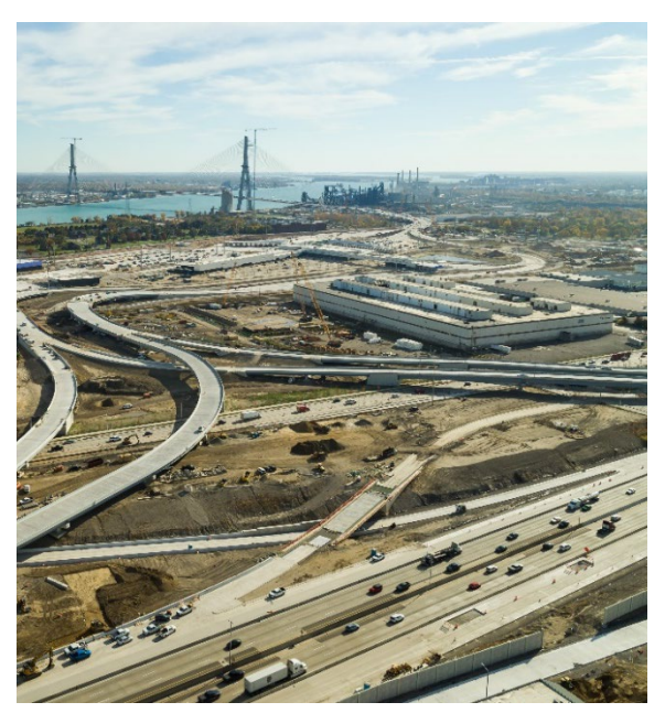
I-75 construction including ramps to US POE.

Work on the 1.8 mile/3 kilometre stretch of I-75 is progressing.