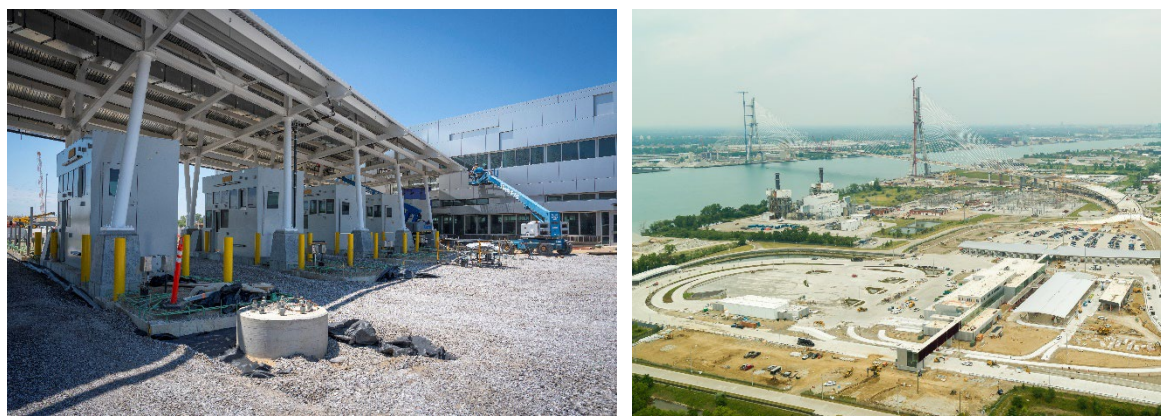
Primary inspection lane construction at the US Port of Entry (left) and the Canadian Port of Entry (right).

All buildings and structures on both the US and Canadian Ports of Entry (POE) are under construction. Many buildings have interior finishings taking place including drywall, trim finishings, flooring and plumbing fixtures. Other activities include paving, landscaping and fence installation throughout the sites.