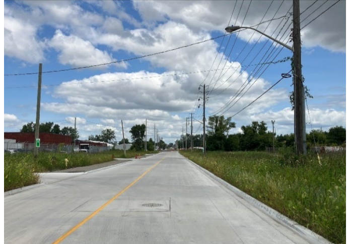
Sandwich Street between Ojibway Parkway and McKee Road.

In addition to the reconstruction work, the BIA is being enhanced through a $1 million Community Benefits Plan investment. These enhancements include landscaping, hardscaping and gathering spaces that will result in a vibrant area for residents and visitors. Some of these features are underway including installation of concrete planters, soil cells (underground infrastructure to support healthy tree growth), and pre-cast pavers in a historical colour creating feature areas at key intersections.