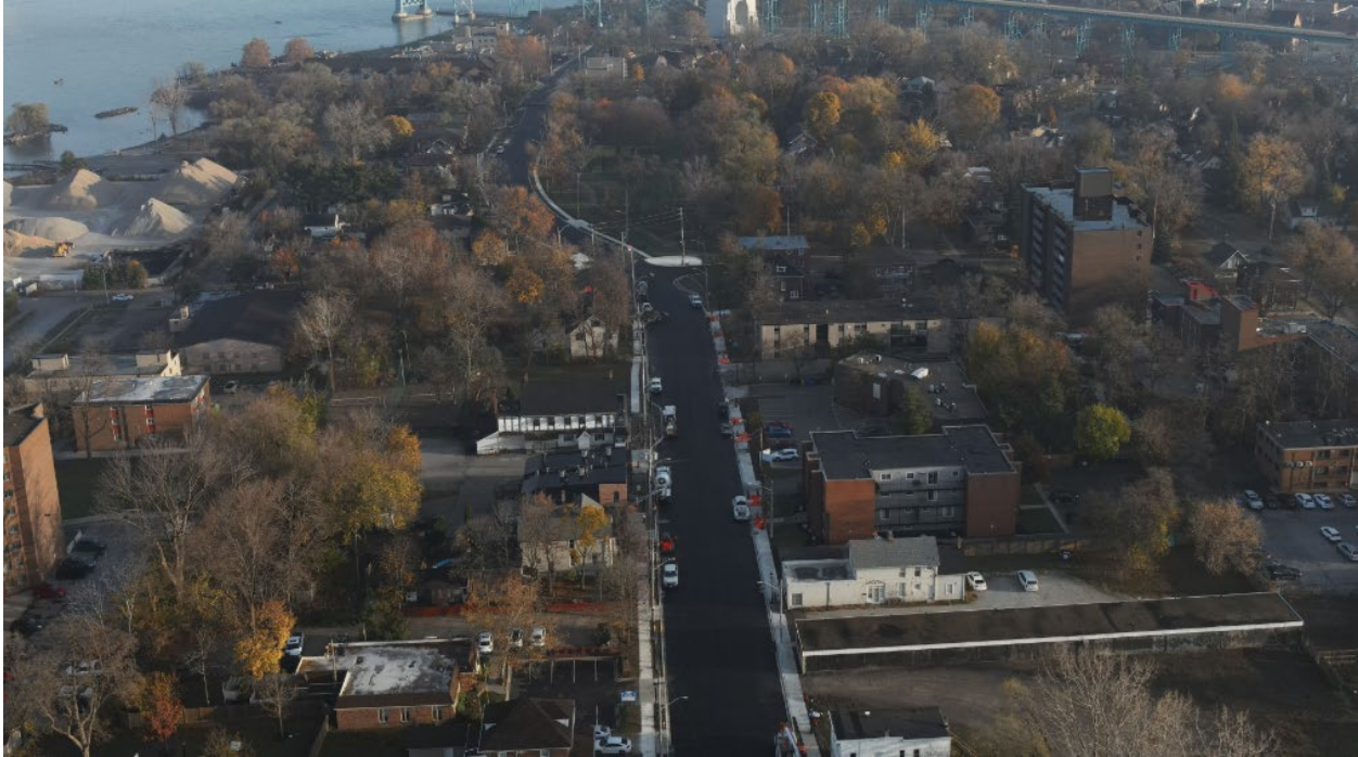
Sandwich Street reconstruction progress facing east from Mill Street.

Funded by the Gordie Howe International Bridge project, three kilometres of Sandwich Street is being reconstructed from the Canadian Port of Entry at McKee Avenue to the Rosedale Avenue roundabout.