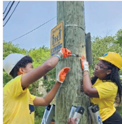
Students from the AmeriCorps Urban Safety Program install a Safe Route to School sign in Southwest Detroit.

AmeriCorps youth members completed five Safe Routes to Schools assessments in Southwest Detroit. After observing students walking to school, members established safe routes which they marked by installing signs and painting footprints on the sidewalks. Ongoing safety intervention programming, several property board-ups and a community event also took place over the summer months.