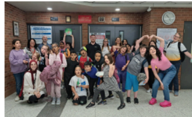
Ignite Academy students and staff during after school programming.

Ignite Academy staff continued to deliver wrap-around supports and afterschool programming for 30 young people and their families at General Brock Public School in Sandwich. In addition to programming, the team provided over 500 community referrals and language interpretations to address unique needs and enhance communication for students and their families.