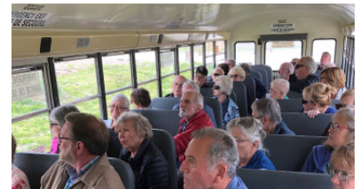
ElderCollege, Tour of the Canadian POE