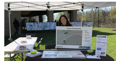
Earth Day, Malden Park