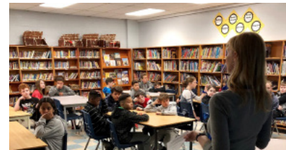
Presentation to a Hetherington School Grade 6 Class

School's out and the weather has allowed us to spend more time outside exploring. We want you to have a safe and enjoyable summer with family and friends which is why we are reminding you that while on your summer adventures to please refrain from planning a trip to our construction sites. Our sites are closed to the public not only for your safety and security, but also for those working on site. We appreciate your cooperation in this matter and invite you to take a look through our online gallery at GordieHoweInternationalBridge.com or follow us on Instagram.