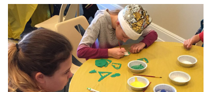
Miracle in Sandwich, Windsor