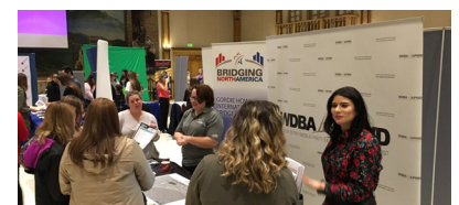
Build a Dream, Windsor