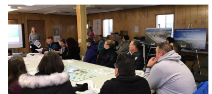
GECD SB Geography Teachers at Canadian Port of Entry learning about the bridge