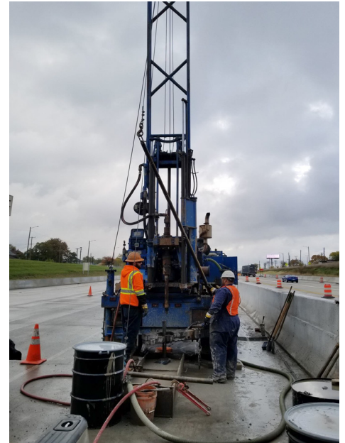
Field crews undertake geotechnical work

In the first part of 2019, motorists travelling near the future site of the US POE should plan a few extra minutes onto their travel as road closures will occur to accommodate Phase 1 work. Closures are set to occur on the cross streets between South Street and Jefferson Avenue and include Schroeder Street, Waterman Street, Rademacher Street, Reid Street, Crawford Street and Livernois Avenue. A signed detour will be in place. The map below shows the closures in more detail.