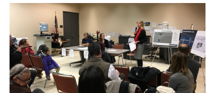
4th Precinct Community Meeting, Southwest Detroit