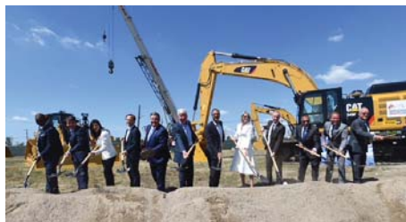
Dignitaries break ground for Michigan Advance Construction

This number serves as your one window access to everyone involved in delivering the project.