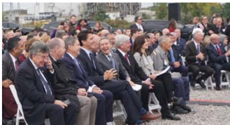
Elected officials attend the official start of construction event