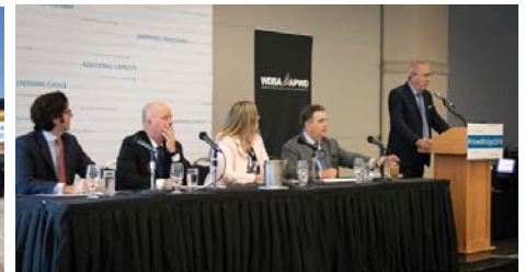
Media briefing on details of Financial Close