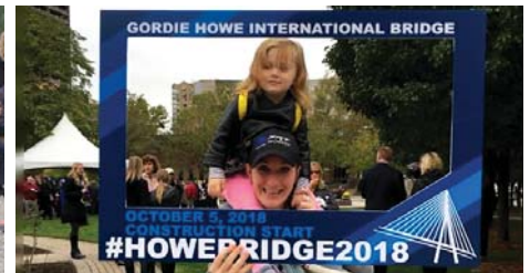
Community members participate in a construction start celebration