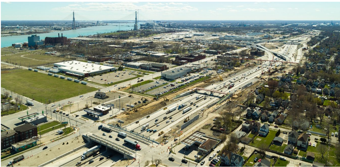
I-75 construction progress

As part of the I-75 work, four road bridges were constructed and are open to traffic located at Springwells Street, Green Street, Livernois and Clark Street. Construction of five pedestrian bridges continues at Solvey, Waterman, Beard, Junction and Lansing Streets.