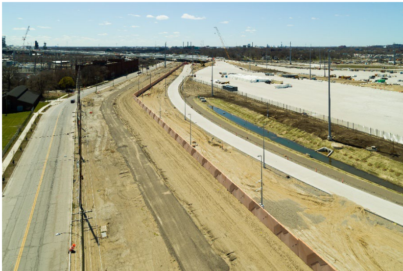
Jefferson Avenue barrier wall construction progress.

At the US POE, construction of the Jefferson Avenue barrier wall, an eight-foot security wall along the southern boundary of the US Port of Entry (POE), is nearing completion. The barrier wall faces Jefferson Avenue and spans from Green Street to Campbell Street. The Jefferson Barrier wall features an aesthetic treatment that plays tribute to the Historic Fort Wayne's unique star fort structure.