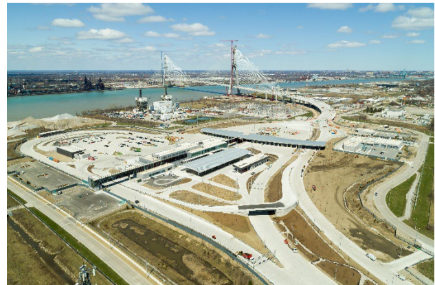
Construction progress of the US POE (left) and Canadian POE (right).