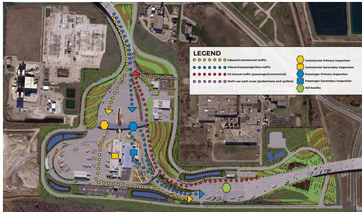
Canadian Port of Entry

The Canadian and US Ports of Entry are the largest along the North American border, with the Canadian Port of Entry clocking in at 130 acres, and the US Port of Entry at 167 acres. The bridge will accommodate commercial, passenger and motorcoach vehicles as well as pedestrians and cyclists. Vehicular toll collection is located at the Canadian Port of Entry. You may be wondering how different types of vehicles will flow through these large ports. These graphics document how to navigate the Ports with ease.