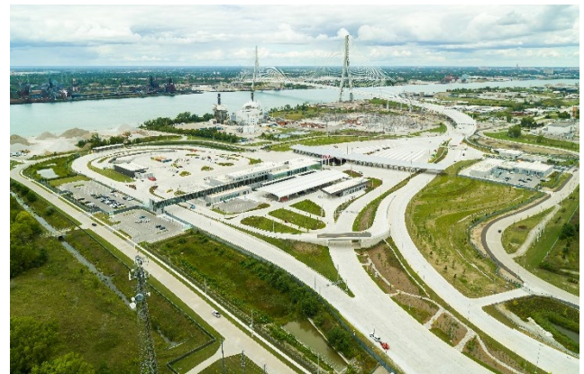
Construction progress of the US POE (left) and Canadian POE (right).