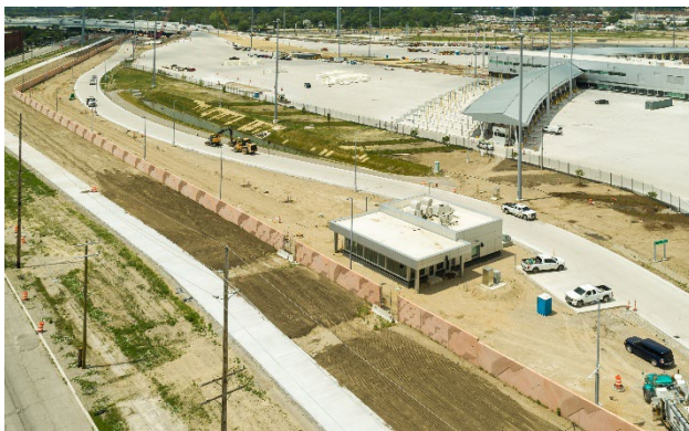
Jefferson Avenue barrier wall construction completion.

At the US POE, construction of the eight-foot-high Jefferson Avenue barrier wall is complete. The barrier wall faces Jefferson Avenue and spans from Green Street to Campbell Street, bordering the multi-use path installed for pedestrians and cyclists. The Jefferson Barrier wall features an aesthetic treatment that plays tribute to Historic Fort Wayne's unique star fort structure.