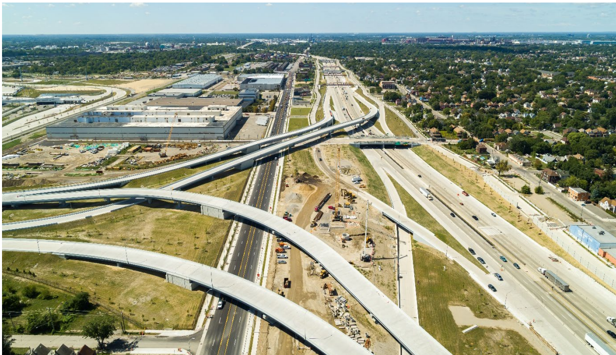
I-75 construction progress.

As part of the I-75 work, four road bridges were constructed and are open to traffic located at Springwells Street, Green Street, Livernois and Clark Street. Construction of five pedestrian bridges continues at Solvay, Waterman, Beard, Junction and Lansing Streets.